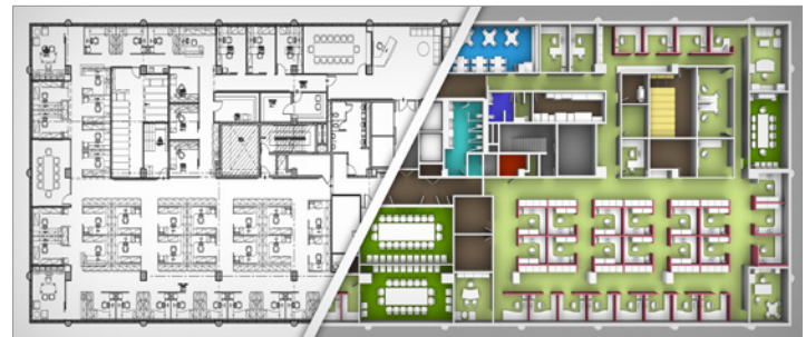
Photo Above: Split view of EPA's floor plan, before and after, in which we developed a 3D layout of the office space for Mural 1.

Photo Top: One of eight (8) murals designed for the EPA's Puerto Rico Office.